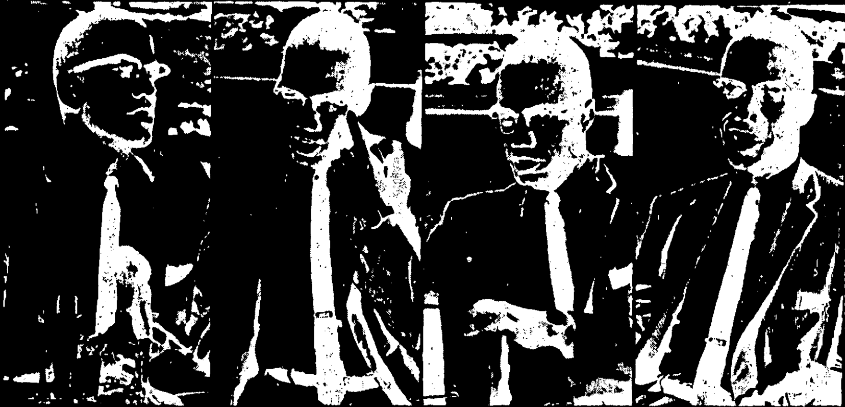
(Malcolm X speaking in Sacramento below)